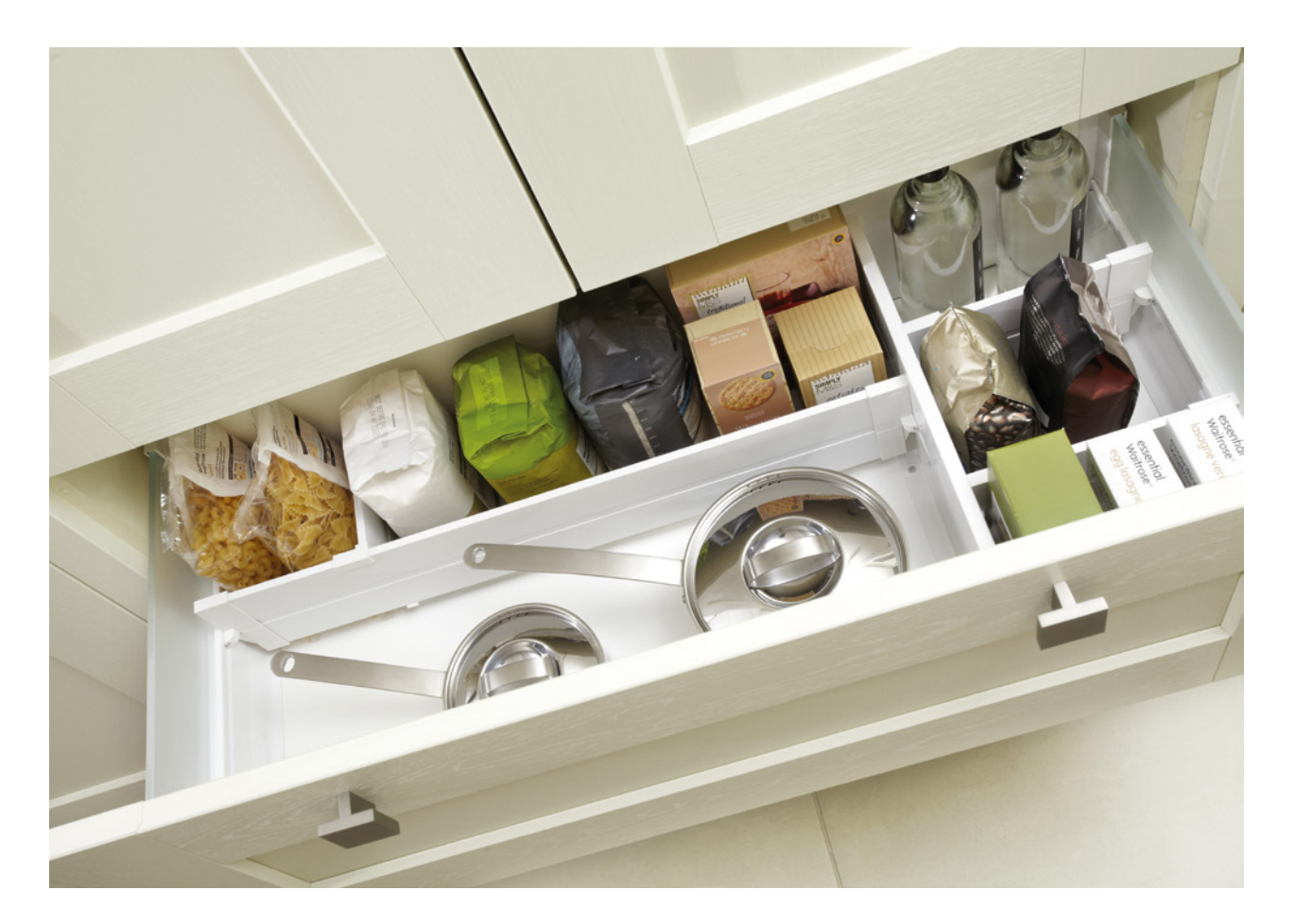
ABOVE MARLOW IN IVORY WITH KNOB (K52) AND BLUM ORGALINE DRAWER DIVIDING SYSTEM OPPOSITE MARLOW IN IVORY WITH KNOB (K52)