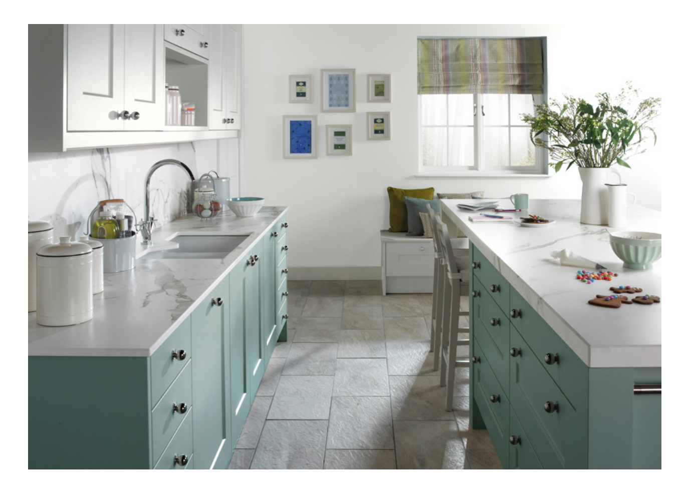
ALL IMAGES STOWE IN MATT PORCELAIN AND PAINTED FJORD GREEN WITH KNOB (K149)