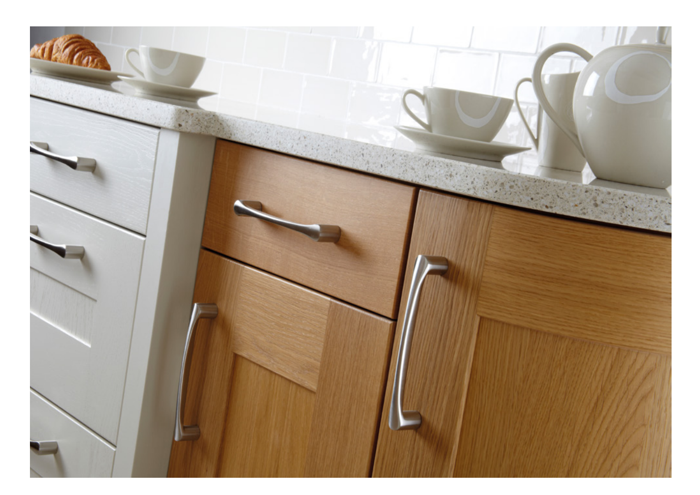
ABOVE LANSDOWNE IN NATURAL OAK AND PAINTED MUSSEL WITH HANDLE (K146) OPPOSITE LANSDOWNE IN NATURAL OAK WITH KNOB (K52)