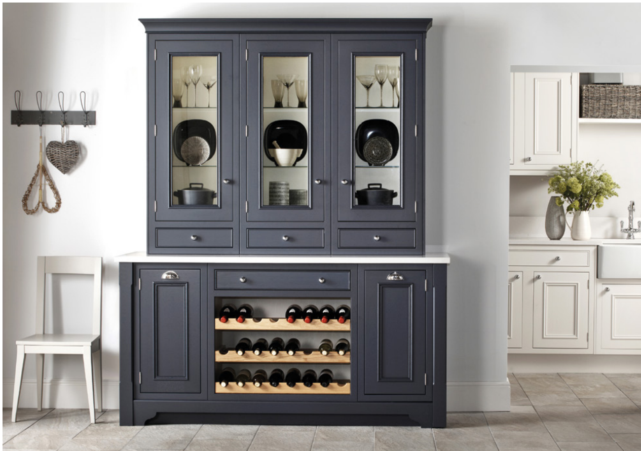
ABOVE SALCOMBE IN PAINTED CHALK AND CHARCOAL WITH CUP HANDLE (K150), KNOB (K149) AND HINGE (H3) OPPOSITE SALCOMBE IN PAINTED CHALK WITH CUP HANDLE (K150), KNOB (K149) AND HINGE (H3)