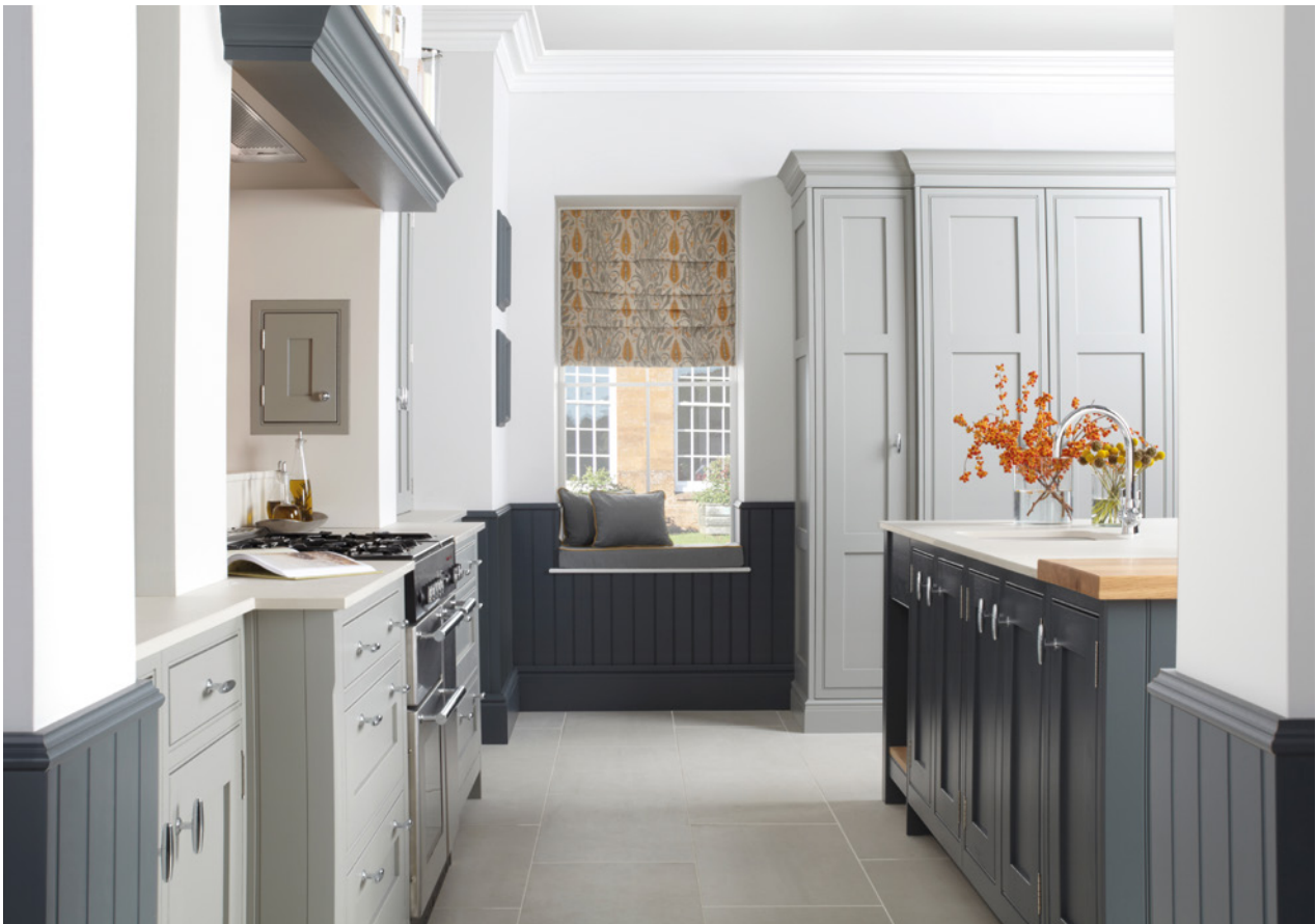
ALL IMAGES LANGTON IN PAINTED GRAVEL AND SEAL GREY WITH KNOB (K149), T-BAR (K166) AND HINGE (H5)