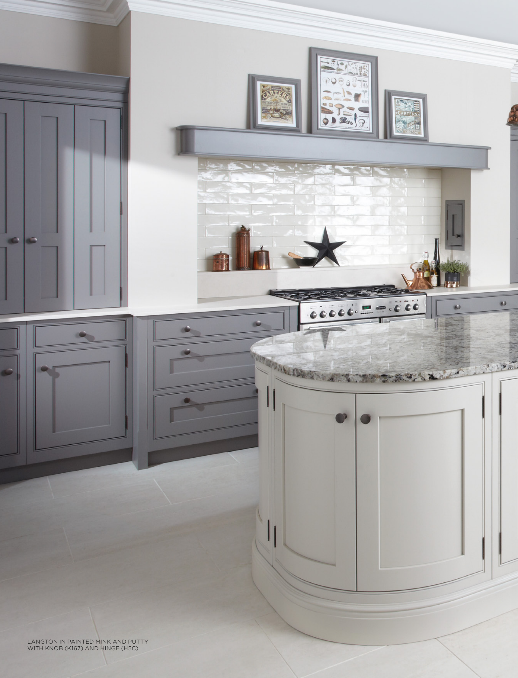
LANGTON IN PAINTED MINK AND PUTTY WITH KNOB (K167) AND HINGE (H5C)