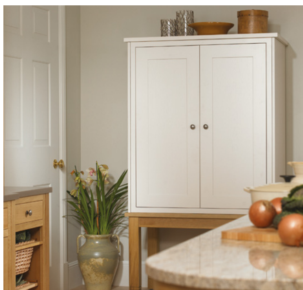
TOP PETWORTH IN PAINTED FRENCH GREY WITH KNOB (K135) BOTTOM LEFT PETWORTH IN NATURAL OAK AND PAINTED MUSSEL WITH KNOB (K134) BOTTOM RIGHT PETWORTH IN NATURAL OAK AND PAINTED FRENCH GREY WITH KNOB (K134) OPPOSITE PETWORTH IN PAINTED FRENCH GREY WITH KNOB (K135)