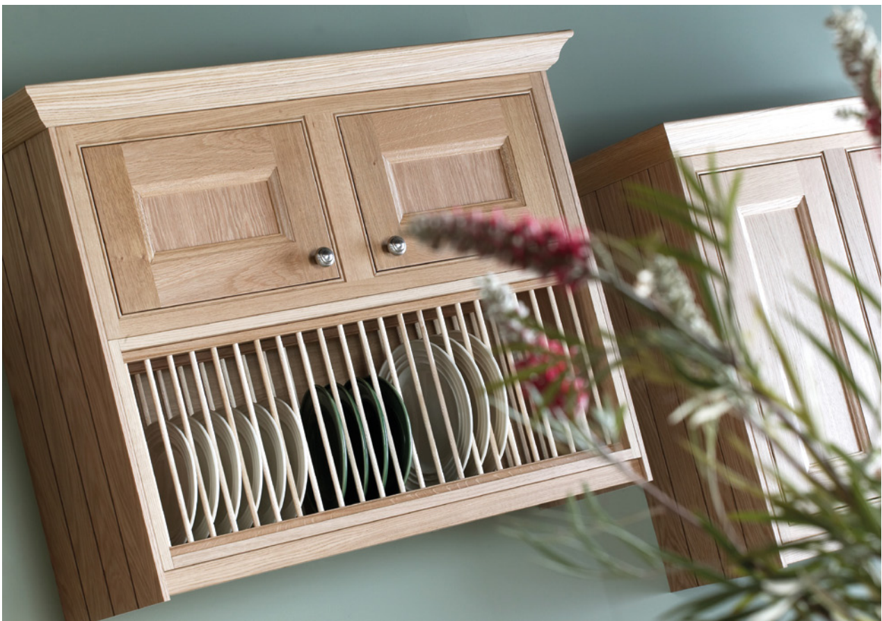
ALL IMAGES TETBURY IN NATURAL OAK AND PAINTED WILLOW WITH KNOB (K144)