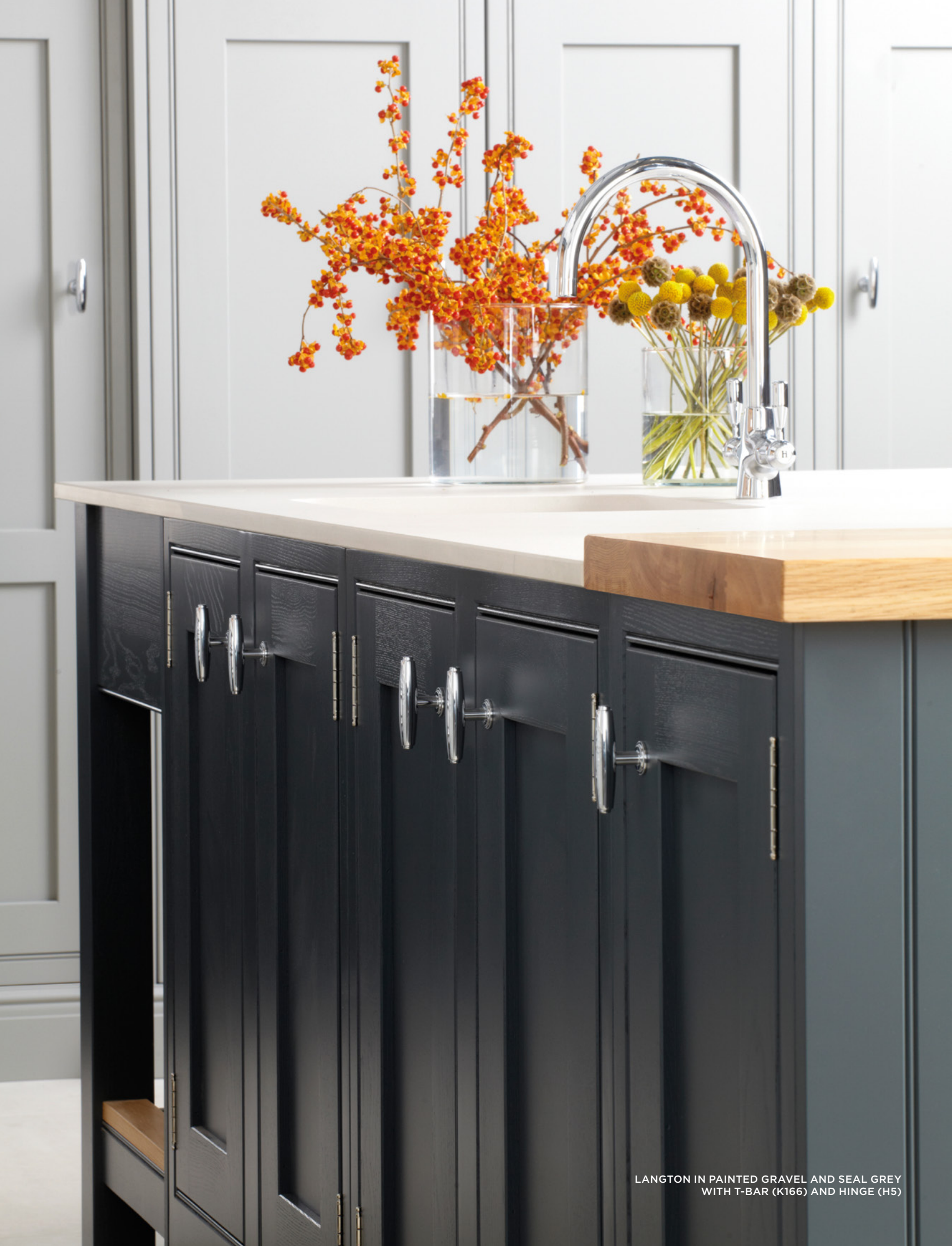
LANGTON IN PAINTED GRAVEL AND SEAL GREY WITH T-BAR (K166) AND HINGE (H5)