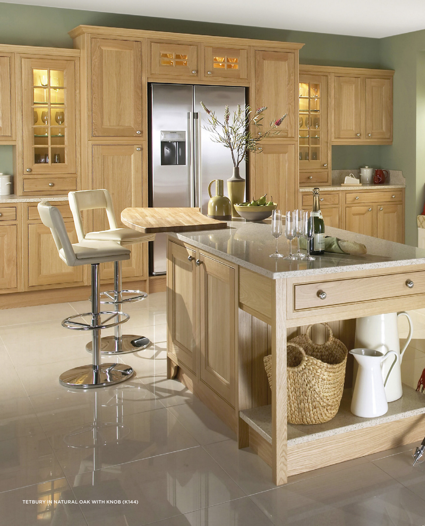
TETBURY IN NATURAL OAK WITH KNOB (K144)