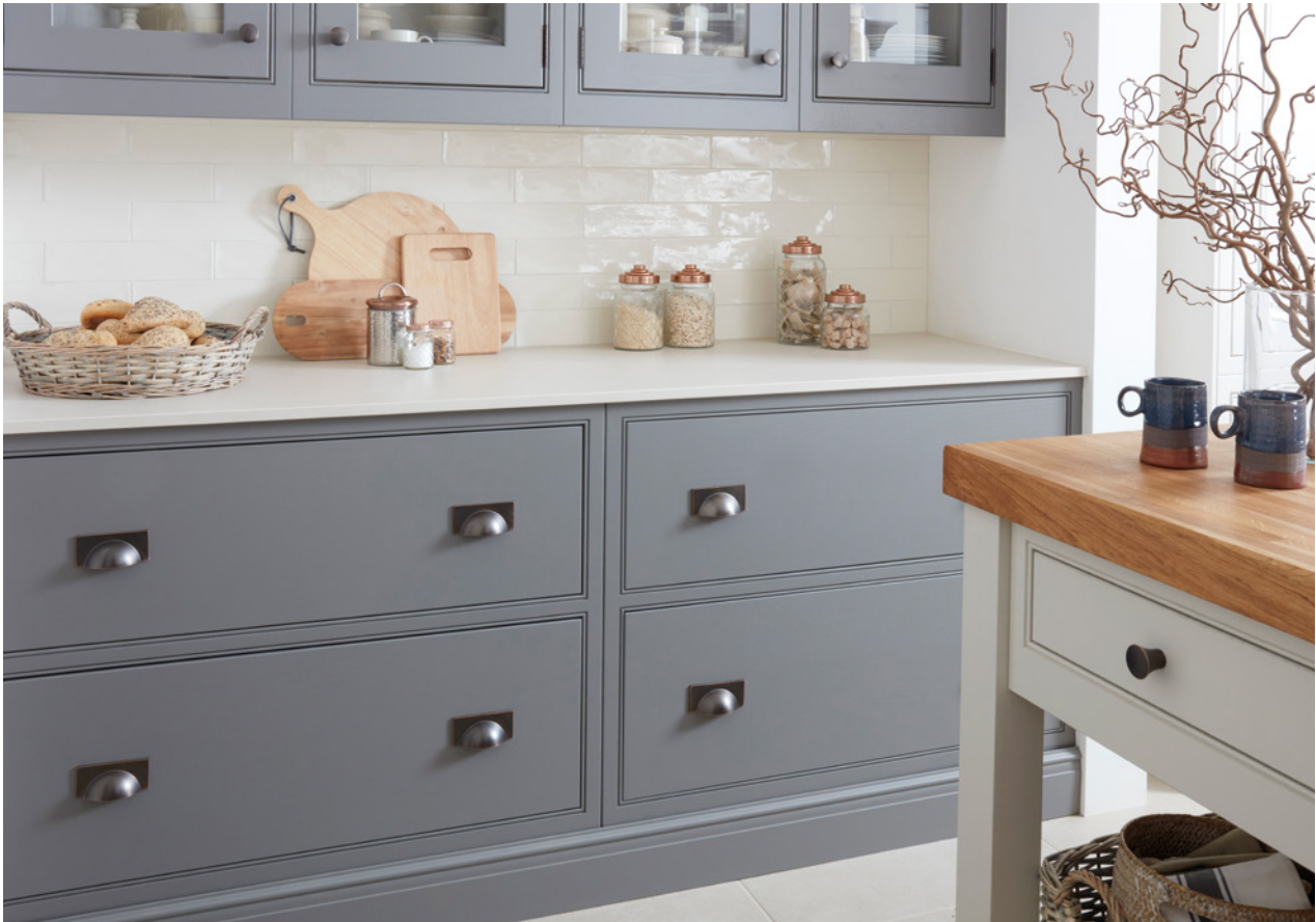
ABOVE LANGTON IN PAINTED MINK AND PUTTY WITH CUP HANDLE (K178) AND KNOB (K167) OPPOSITE LANGTON IN PAINTED MINK AND PUTTY WITH KNOB (K167) AND HINGE (H5C)