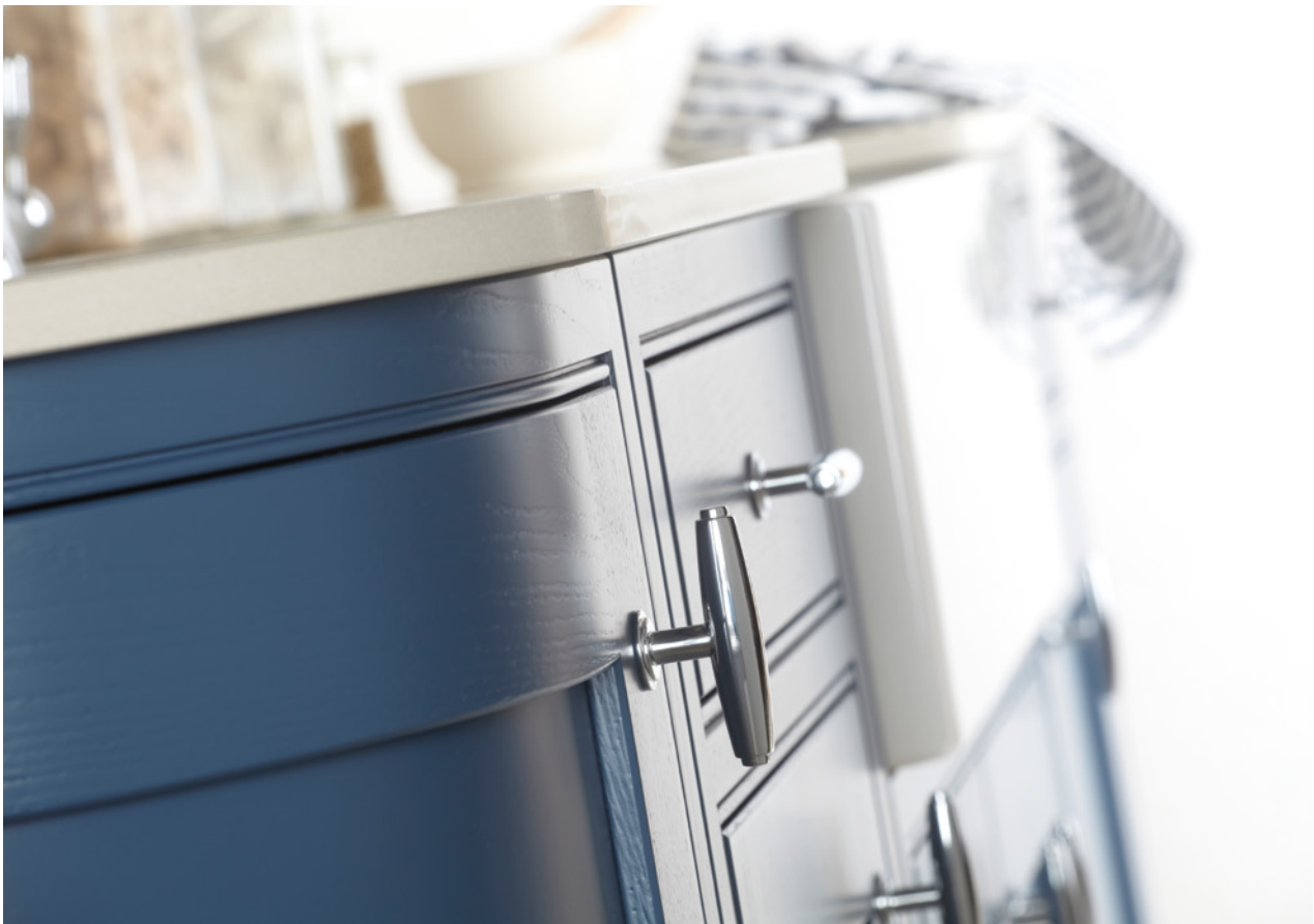
ALL IMAGES LANGTON IN PAINTED OLD NAVY AND SOFT GREY WITH T-BAR (K166)