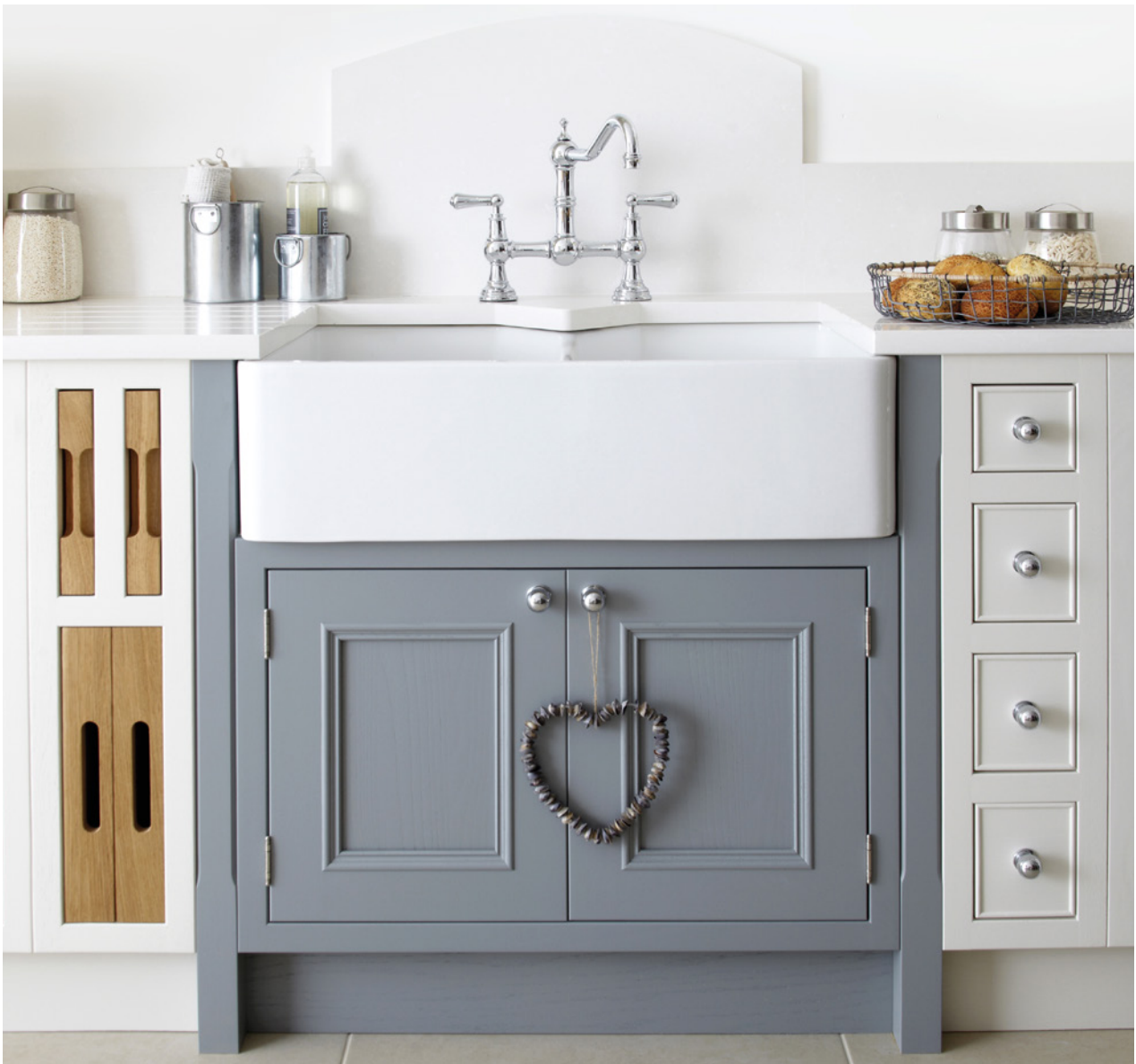
ALL IMAGES SALCOMBE IN PAINTED CHALK AND LEAD WITH KNOB (K149) AND HINGE (H3)