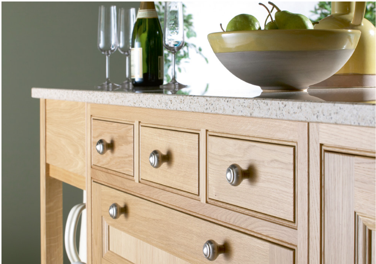
ABOVE TETBURY IN NATURAL OAK WITH KNOB (K144) OPPOSITE TETBURY IN NATURAL OAK AND PAINTED WILLOW WITH KNOB (K144)